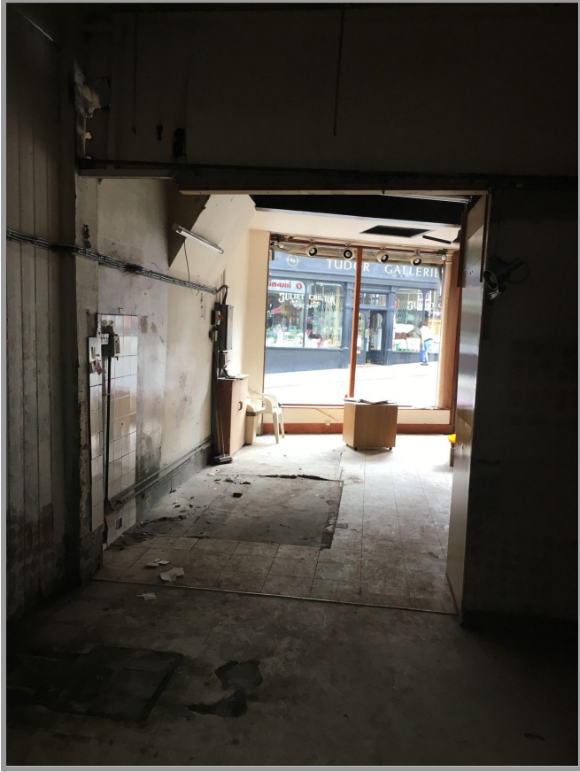
Before Images (Shop, left) (Terrace, right)